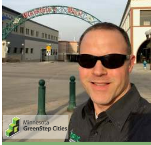
NEW ULM JOINS GREENSTEP CITIES PROGRAM

Access the story map: https://bit.ly/3mCkpgs Access the mapping tool: https://bit.ly/3gzauEw