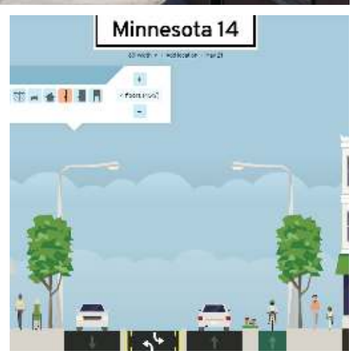
Student's vision of Tracy roadway using streetmix.net's street programming.

Tracy residents will soon see an invitation to participate in