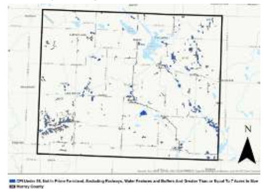
Primary Siting Scenario

that asked questions such as, "In what ways can you see solar as being beneficial or burdensome in Murray County?"