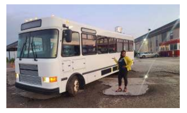
to also find ways to be more efficient and sustainable.

The proposal was for a feasibility study about putting solar on her World Mart food truck. The objective is to study how to make the bus more efficient and sustainable in a cost-effective manner. The lessons learned could then be applied to mobile food vehicles in general. She wants to inspire others in her diverse community