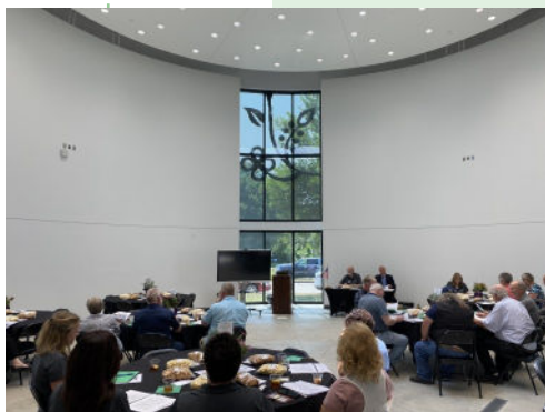
At Cansayapi Wicoicage Oti, the Lower Sioux Indian Community Cultural Incubator

The Southwest Regional Development Commission celebrated its 50th Anniversary at the Annual Meeting at the Lower Sioux Indian Community on July 13, 2023.