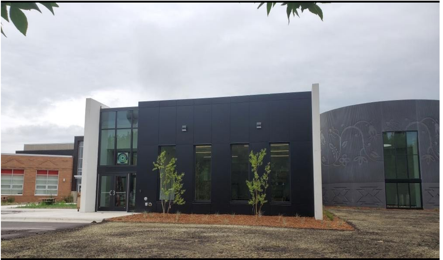
Lower Sioux Intergenerational Cultural Incubator

Center for Regional Development 2401 Broadway Ave, Slayton, MN