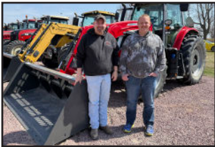
Mt. Lake, MN

Midway Farm Equipment: A Local Partnership Growing Strong in Mountain Lake