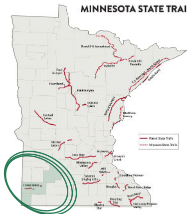
MINNESOTA STATE TRAILS

14 Of those miles are located in Southwest Minnesota